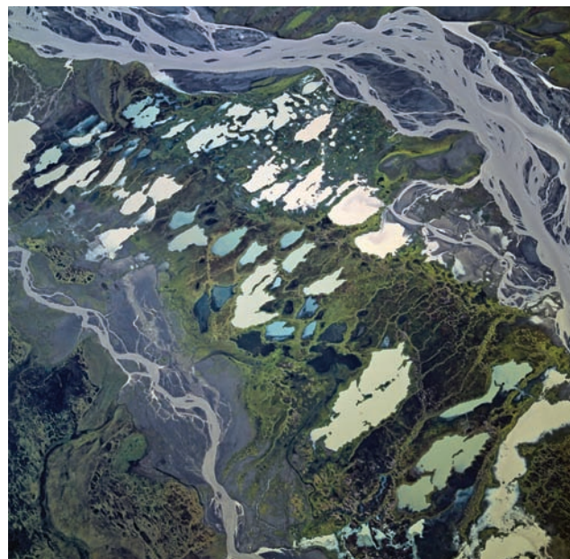
RAPID CHANGE: Feedback mechanisms could be speeding up global warming: thawing permafrost, like that in central Iceland ( left ); retreating glaciers such as Trift in the Swiss Alps ( center ), which has receded three kilometers; and melting ice that spills into the sea, seen in Spitsbergen, Norway ( right ).

In Antarctica and Greenland, large ice shelves that float on ocean water along the coast are collapsing—a wake-up call about how unstable they are. Warmer ocean waters are eating away at the ice shelves from below while warmer air is opening cracks from above. The ice shelves act as buttresses, holding back ice that is grounded on the ocean bottom and adjacent glaciers on land from sinking into the sea under gravity’s relentless pull. Although the loss of floating ice does not raise sea levels, the submerging glaciers do. “We’re now working hard to find out whether sea-